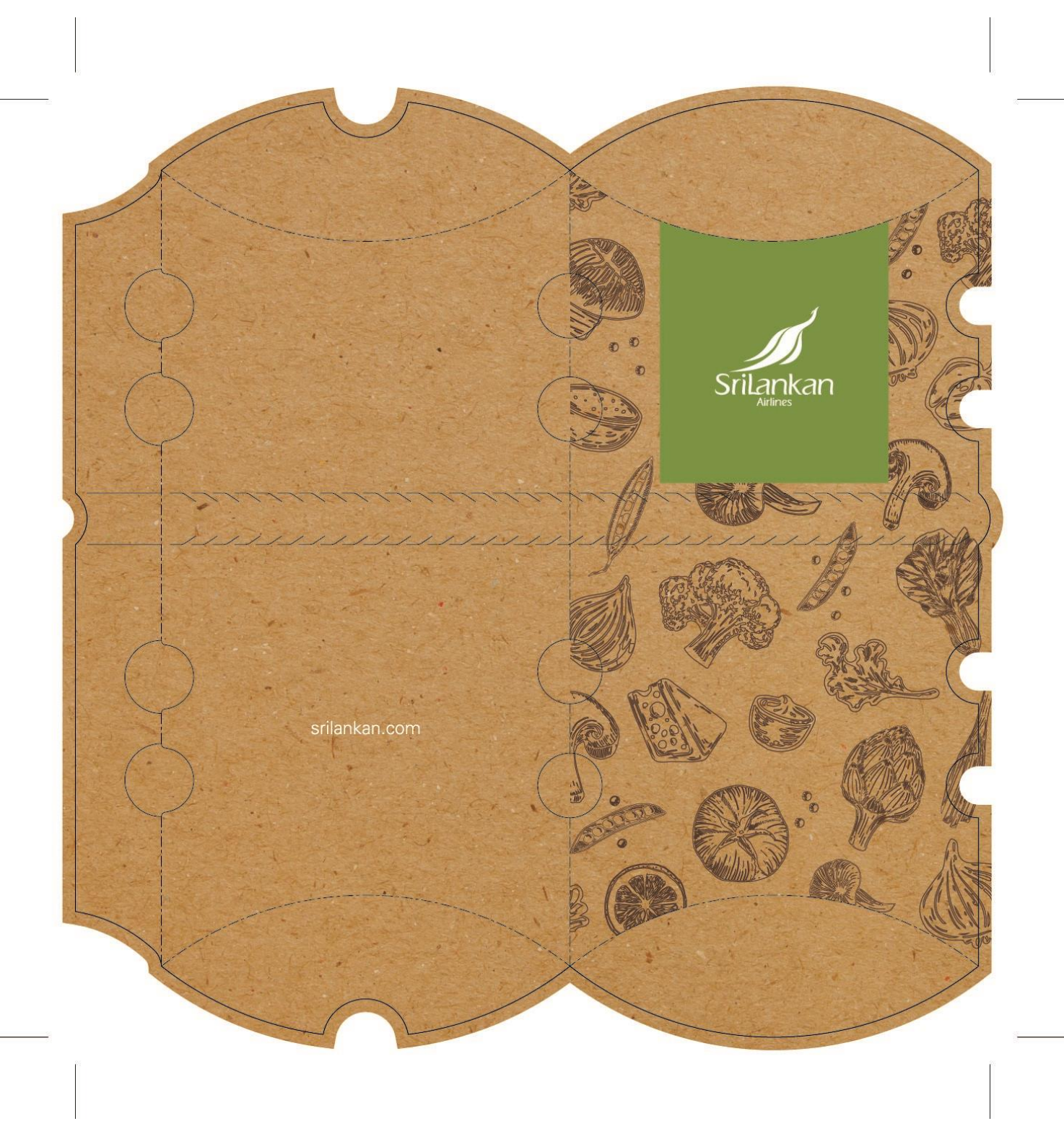
CA072 - HOT BOX VEG 02 (95X33X185MM) 220gsm